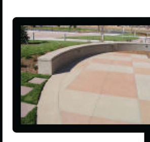
Several colors of Sandscape Texture and a seat wall (above) highlight this courtyard.