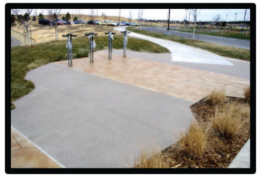
The hospital above alternates Sandscape Texture with Bomanite imprinted concrete.

This city center uses Sandscape Texture finished paving and special "V" saw-cuts and black banding to accomplish a clean modern look.